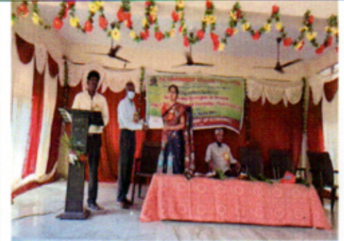
Valedictory Function and Certificate distribution.