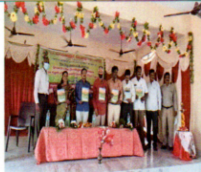
Proceedings of the Seminar Book Opening.